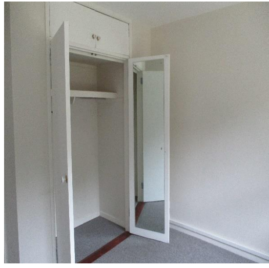
Bedroom (2): 10'2 x 8'1 New carpet. USB socket.